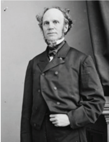
Governor Horatio Seymour of New York

lawmakers.” 45 The situation was so bad in Indiana that Stanton loaned Morton $250,000 from a War Department slush fund to run the state and hopefully bypass the state legislature. “If the course fails,” Stanton warned Morton, “you and I will be covered with prosecutors, imprisoned, [and] driven from the country.” 46