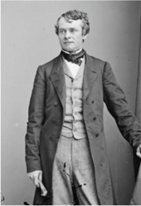
Governor Andrew Curtin of Pennsylvania

The task of preserving the Union also fell on loyal Democratic governors, who while championing their party's causes, including states' rights and slavery, nonetheless supported the Union war effort. Notable Democrats (as well as those who joined the Union ticket in 1864) included Thomas Bramlette (Kentucky), John Brough (Ohio), William Burton (Delaware), John Downey (California), Joel Parker (New Jersey), Horatio Seymour (New York), David Tod (Ohio), and John Whiteaker (Oregon). The choice to remain loyal and direct their states' resources to support