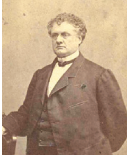
Governor John A. Andrew of Massachusetts