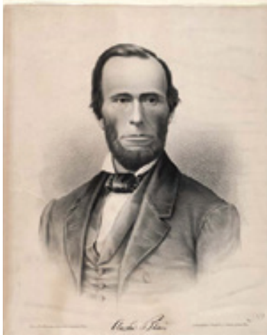
Governor Austin Blair of Michigan

To bring more governors on board, Andrew and his radical gubernatorial supporters agreed to meet again at Altoona, Pennsylvania, in hopes of securing the necessary support to carry the measure forward, which they believed Lincoln would accept. “Next to the Proclamation of Emancipation,” remarked Philadelphia journalist John Russell Young, the Altoona conference was “the most decisive civil event of the war.” 36 Well aware of the governors’ power, Stanton was impressed that they had initiated such a meeting, and he wired Ohio Governor Tod that he hoped the counsels of the governors would be “wise and produc-