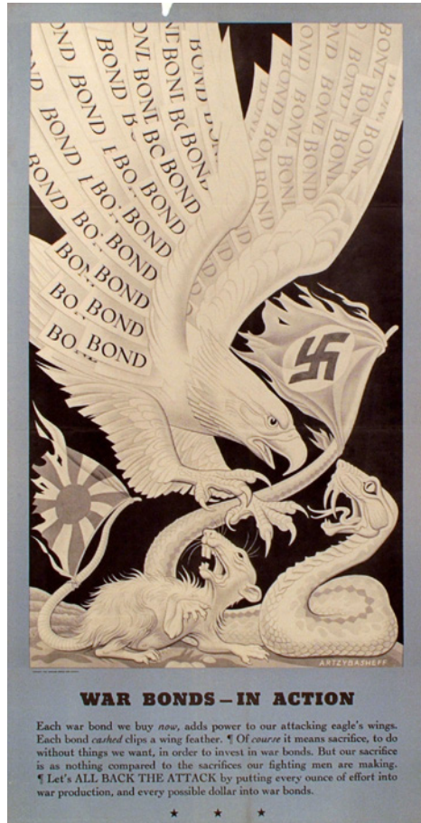
Figure 4: Boris Artzybasheff, “War Bonds – In Action,” ink on paper, 43 by 21 inches. The War Advertising Council created this poster for the Treasury’s Fourth War Loan campaign that ran from January 18 to February 15, 1944. The campaign slogan was “Let’s ALL Back the Attack!” The Wickwire Spencer Steel Company sponsored its placement.

to individuals gleaned the $5 billion difference between the two campaigns. 44 That year, the Advertising Council changed its name to the War Advertising Council to align its work closer to the war effort and asked businesses to devote one-third of all advertising to war messages. 45 By September 1943 American businesses had donated approximately $200 million worth of advertising for the war cause. On September 8, 1943, Italy surrendered, a positive event in the war but possibly problematic for the War Loan campaign as the third campaign ran from September 9 to October 2, 1943. The War Advertising Council immediately created one of the most successful slogans in all the campaigns—“Back the Attack,” which it wired to over 1,700 newspapers. 46 The slogan was so successful that Morgenthau wanted to use it again, but the War Advertising Council wanted something new. Treasury strategist Ted R. Gamble, who directed the program, found a compromise for the next two campaigns. 47 The slogan for the fourth campaign, which ran from January 18 to February 15, 1944, was “Let’s ALL back the attack.” This was the slogan used in the “War Bonds – In Action” poster created by Boris Artzybasheff (figure 4). For the fifth campaign that ran from June 12 to July 8, 1944, the slogan was “Back the Attack – Buy More Than Before.” The goal for the Fifth