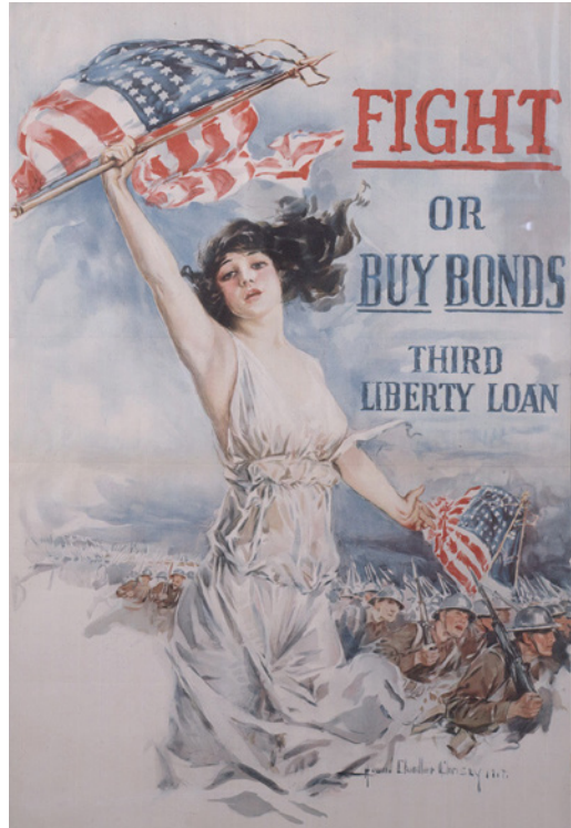
Figure 1: Howard Chandler Christy, “Fight or Buy Bonds,” ink on paper, 30 by 20 inches. The Division of Pictorial Publicity of the CPI created this poster for the Treasury’s Third Liberty Loan campaign in 1918. This poster was applied to the wings of World War I ace Eddie Rickenbacker’s aircraft.

The airplane played a serious fighting role in World War I. In 1917 the United States set up the 94th Aero Pursuit Squadron under Maj. Raoul Lufbery at the aerodrome near Villeneuve, France, about 15 miles from the front lines. On April 14, 1918, the American pilots flew their first combat missions. One of the pilots was Eddie Rickenbacker, who garnered fame for his success in the air. In his autobiography, Rickenbacker wrote that prior to his first successful combat mission, “The image of a Liberty Bond poster popped into my mind. It was a beautiful girl with outstretched arms. In big black letters were the words ‘Fight or Buy Bonds.’ Well, I did not have much choice.” 16 The 94th Aero Pursuit Squadron created an insignia called “Hat in the Ring,” with a top hat adorned with the stars and stripes encircled with a ring. Pilots also customized their aircraft. Christy’s Liberty Bond posters were affixed to the upper-right and lower-right wings of Rickenbacker’s Nieuport aircraft. 17 Whether the image of liberty or of a beautiful girl, this is one remarkable example of a private and public ritual display of a