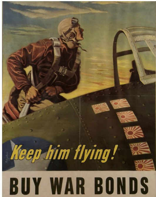
Figure 3: Georges L. Schreiber; "Keep him flying! Buy War Bonds," ink on paper, 29 by 23 inches. The Treasury created this poster for the First War Loan, November 30–December 23, 1942, with the slogan, "Remember Pearl Harbor." The Japanese flag emblems on the aircraft signify that this American pilot shot down six Japanese fighter planes.

Posters, both past and present, are visually stimulating pieces of art. Why, though, are posters valuable historical documents? Their historic value lies in their