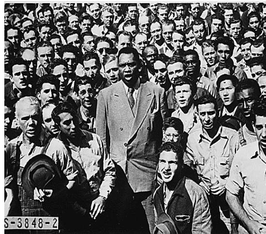
Paul Robeson leads the Moore Shipyard workers in singing the Star Spangled Banner, Oakland, California, September 1942.

Meanwhile, radicals in the People's Front sounded quite conservative as they identified themselves comfortably with some of the iconic figures and moments in American history. Communist Party bookstores and schools were often named after Thomas Jefferson. In 1937, the Young Communist League (YCL) chided the Daughters of the American Revolution (DAR) for neglecting to celebrate the anniversary of Paul Revere's ride. They marched up Broadway in New York City with a sign that read, "The DAR Forgets but the YCL remembers."