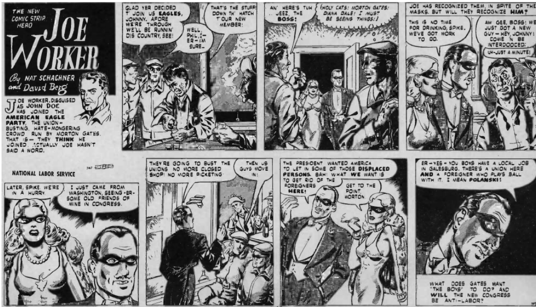
The CIO's comic strip Joe Worker.

The supposed unity of “the people” helped maintain support for the U.S. effort in World War II. The Second World War was far more popular among Americans than was World War I. And this was not only because of the attack on Pearl Harbor. FDR and his spokesmen and allies were able to attack the enemy as a group that was trying to divide Americans by race and religion. In PM , the pro–New Deal daily, Dr. Seuss depicted foes of FDR such as Charles Lindbergh and Gov. Eugene Talmadge of Georgia as unpatriotic bigots.