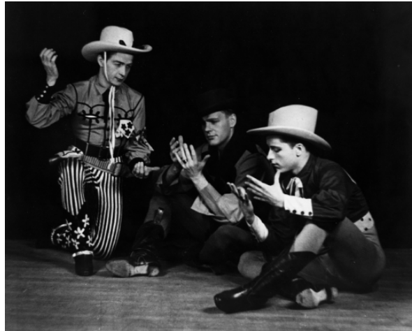
A production photo from Billy the Kid , with music by Aaron Copland.

The creativity and flexibility of New Deal/Popular Front culture enabled its practitioners to tap into certain veins of dissent and resistance that run deep in American history: its anti-authoritarian spirit, its celebration of hard work, and its romance with the land and with regional vernaculars in language and performance. But this flexibility also meant that cultural forms that first blossomed on the left could also work for those who grew hostile to the political causes that helped to spawn them. One of the best examples is On the Waterfront , written to justify Elia Kazan's naming of names to a congressional committee. In other words, "Try and lick that!" could have promiscuous applications.