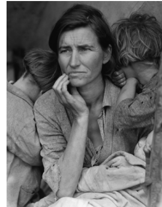
Migrant Mother, Nipomo, California, by Dorothea Lange, 1936.

The culture of the People’s Front was one of the more significant subcultures in U.S. history. It helped unleash the creativity of men and women from immigrant backgrounds and minority races who wanted to claim America—its culture, its history, its tremendous economic opportunities—for themselves. This included novelists like Richard Wright, Tillie Olsen, Henry Roth, Pietro di Donato, and Thomas Bell—none of whom was a white Protestant.