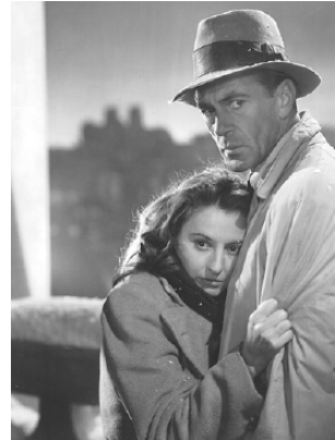
Barbara Stanwyck and Gary Cooper in Meet John Doe , 1941.

In 1941, director Frank Capra and scriptwriter Robert Riskin, a passionate New Dealer, created Meet John Doe , an allegory of a failed fascist takeover of the United States. The film concludes with perhaps the purest expression of populist defiance ever seen on screen. A group of “ordinary Americans”—members of the John Doe Clubs—has just convinced their hero, played by Gary Cooper, not to commit suicide. Their unofficial spokesman, a tough newspaper reporter, turns to the would-be Mussolini—a wealthy publisher named D. B. Norton—and declares: “There you are, Norton! The people! Try and lick that!”