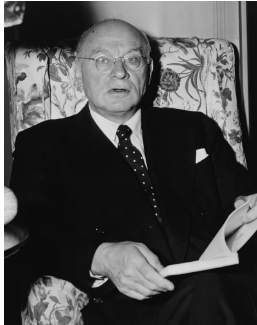
Rep. Emanuel Celler (1888–1981), D-NY, one of the most vociferous opponents of the Immigration Act of 1924. Celler spent nearly 50 years in Congress (1923–1973), making him the longest-serving member of Congress from New York State.

which will be allowed under the Johnson bill, we give the Nordic race, the northern races, 134,824, and you leave 29,360 for the rest of Europe,” Samuel Dickstein exclaimed. 56 Dickstein pointed out that there were approximately 180,000 immigrants from Italy in 1890, but that number skyrocketed to over 1.3 million by 1910—a pattern of increase that also applied to immigration from Russia, and other eastern and southern European countries. 57 Immigration from western and northern Europe, however, followed the opposite trajectory. There were approximately half a million fewer immigrants from Ireland and Germany, respectively, in 1910 than in 1890. 58 “These figures simply illustrate the fact that by comparing the quota basis we are going back to the time when there were the maximum number of immigrants from northern and western Europe—the so-called Nordic race—and the minimum number of immigrants from southern and eastern Europe,” Dickstein concluded. 59 La Guardia likewise asked rhetorically, “What can be more artificial than to go back 34 years and arbitrarily take the census of 1890 for a basis?” 60