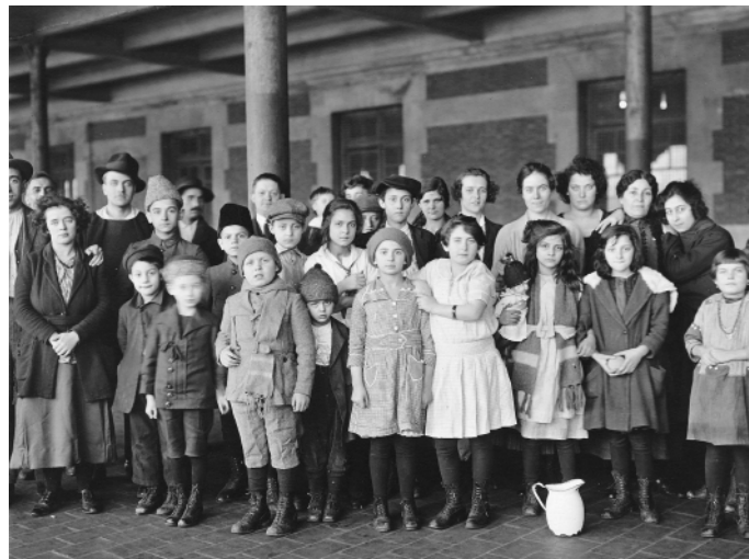
Immigrant children passing through Ellis Island before the Immigration Act of 1924.

The contest over the legality, racism, and “Americanness” of Arizona Senate Bill 1070 recalls earlier immigration debates in American history. If Arizona’s bill is the legislative cause célèbre of 2010, its early 20th-century antecedent was the Immigration Act of 1924 (also called the Johnson-Reed Act). Among its provisions, the Immigration Act of 1924 imposed a quota system based on the 1890 census. The law capped immigration from any particu-